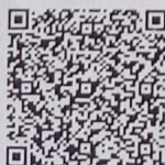
Registrar Pharmacy Council